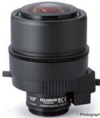
* Photograph is a similar model.

3.4x Applicable camera (model) 1 2/3 1/2 1/3 1/4 For Security