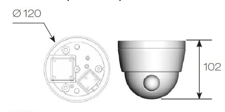
Diagram of mounting holes (unit in mm):